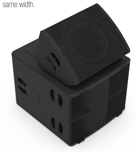
A P15 stacked on top of a L18 offers a compact yet efficient drum fill.

A dedicated minimum latency setup is also available, compatible with the minimum latency monitor setups of the P15. The result is a very efficient drum-fill system, both cabinet sharing the