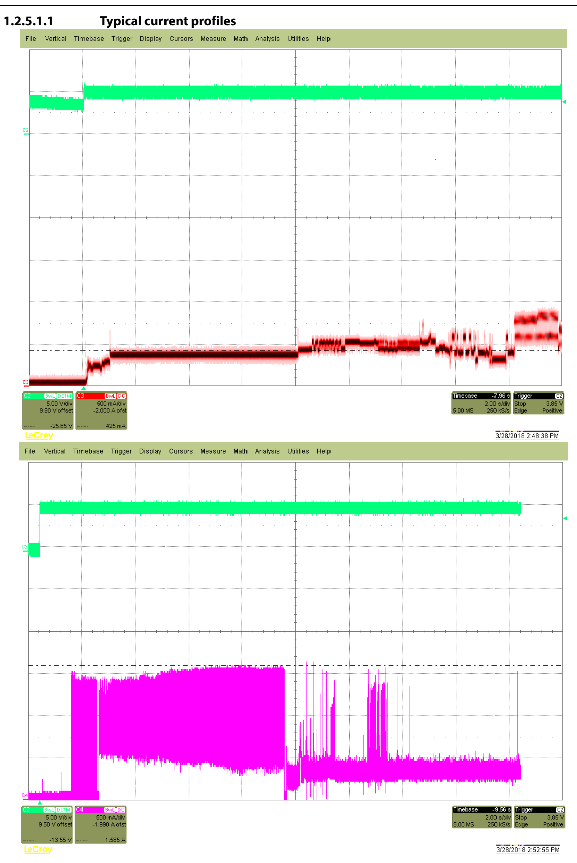
Figure 1. Typical 5V and 12V startup and operation current profiles