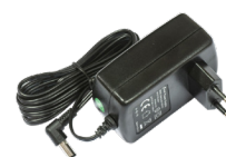
24 V 1.2 A power adapter included

IPsec hardware encryption (~470 Mbps) and The Dude server package are both supported, and the microSD slot provides improved read/write speed for file storage.